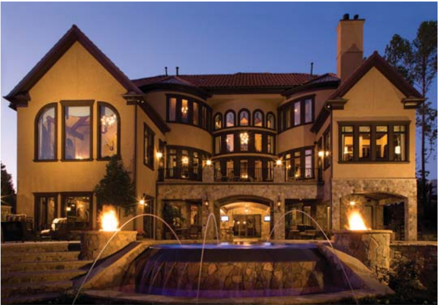
Three levels of living and entertaining space overlook this expansive pool with dramatic fire features that illuminate the outdoor living area.

hate me: they love to see the home when it is done, but they hate it when I come over to them and ask ‘can we do this instead?’” he relates with a laugh.