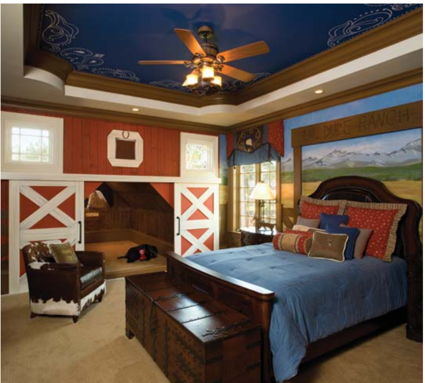
Inspiration for the boy's bedroom came from the view of the neighborhood equestrian center across the street. Functioning barn doors on the play area were designed to mimic the look of those that can be seen through the adjacent window.

home site's magnificent view of the treetops. Autumnal colors like dark chocolate, deep garnet and rich aubergene plum play against the sparkle of crystal chandeliers and dressmaker appliqués incorporated into luxe window treatments, bedding and fabrics.