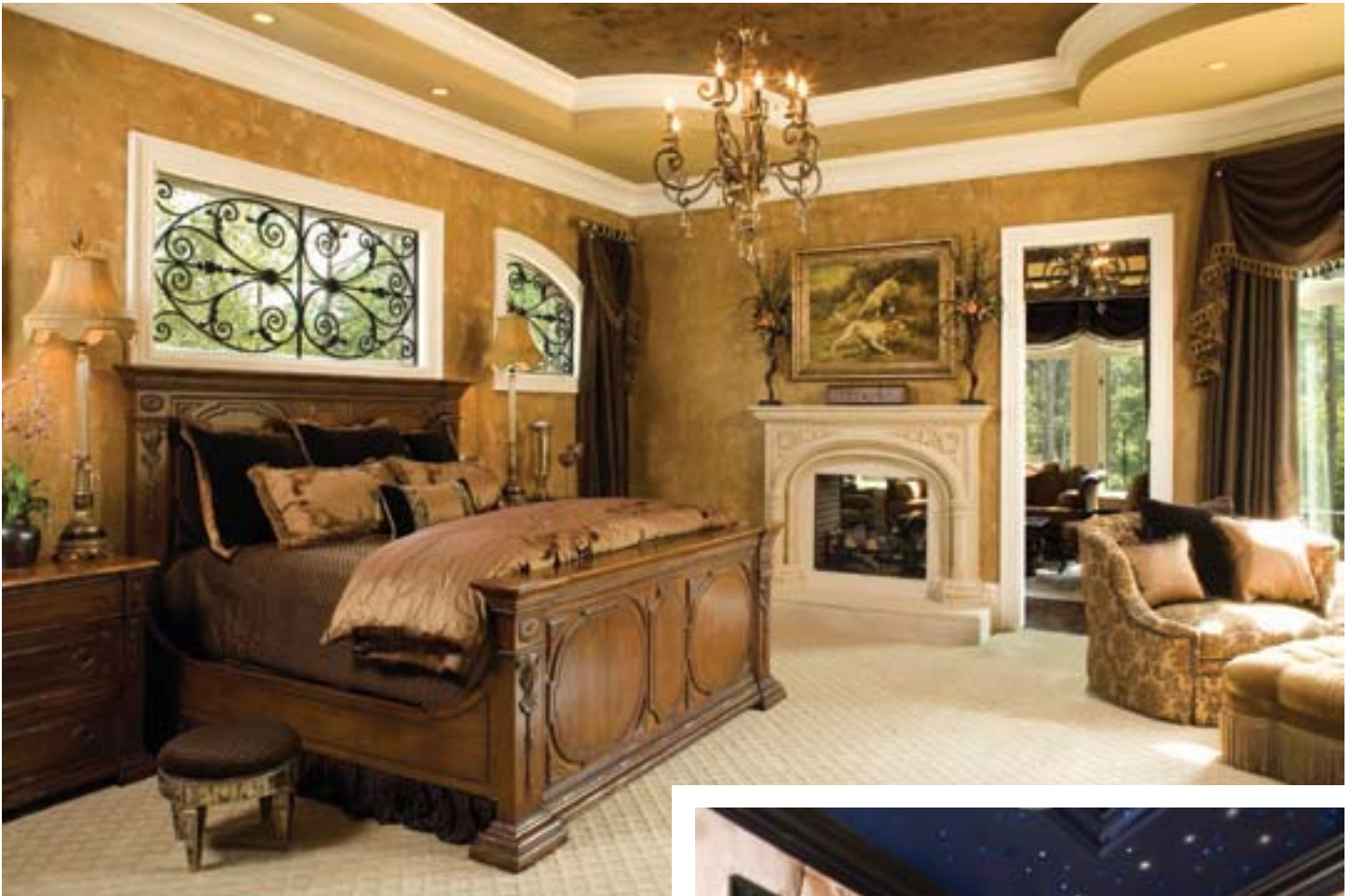
Above: Rich faux finishing and intricate iron work bring an Old World feel to the master suite.